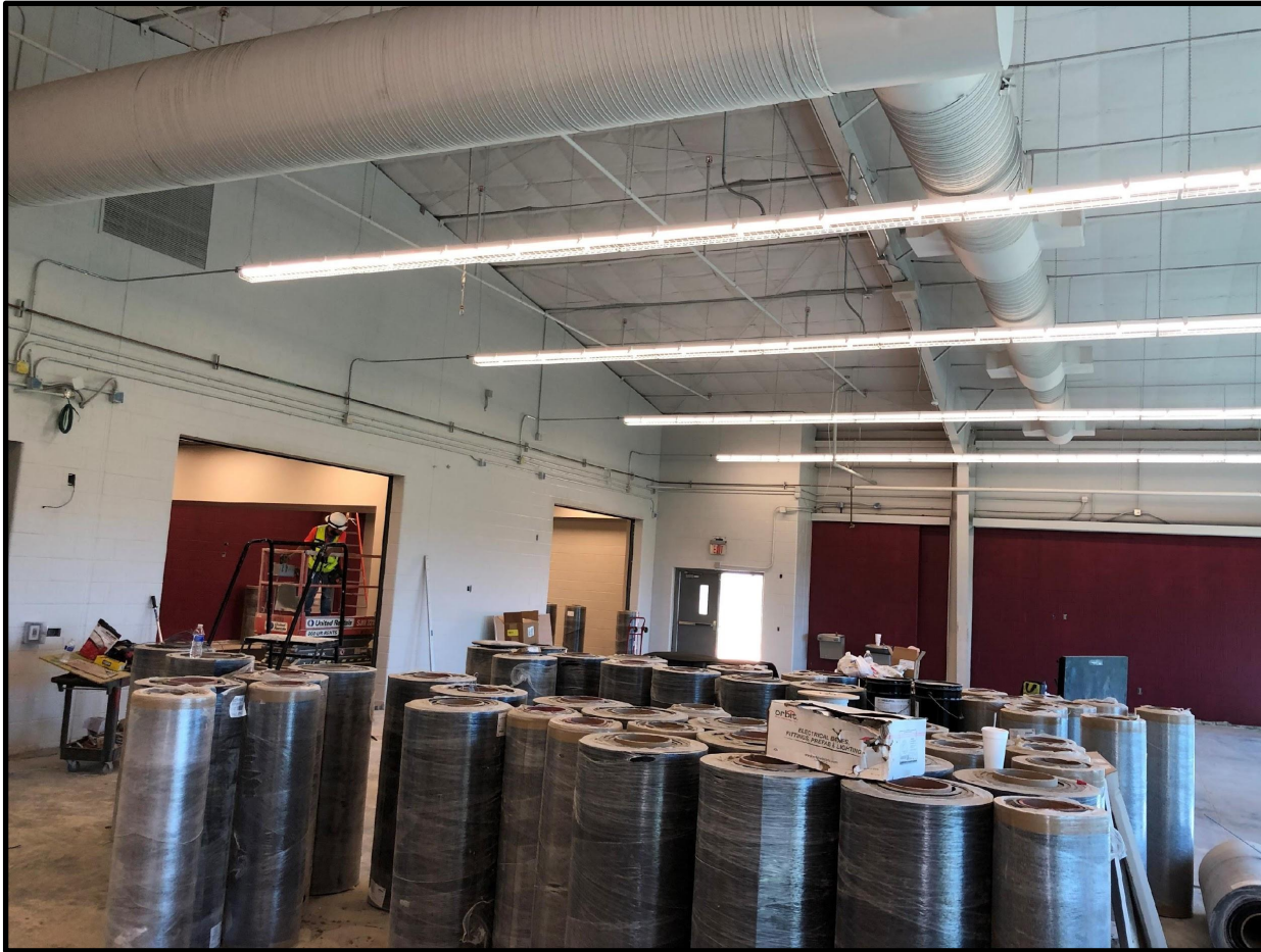
Field House Renovations