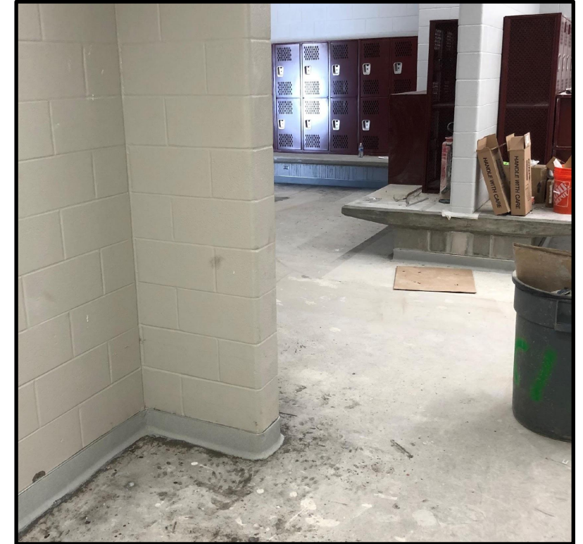
Lockers are being set and prepping for epoxy flooring