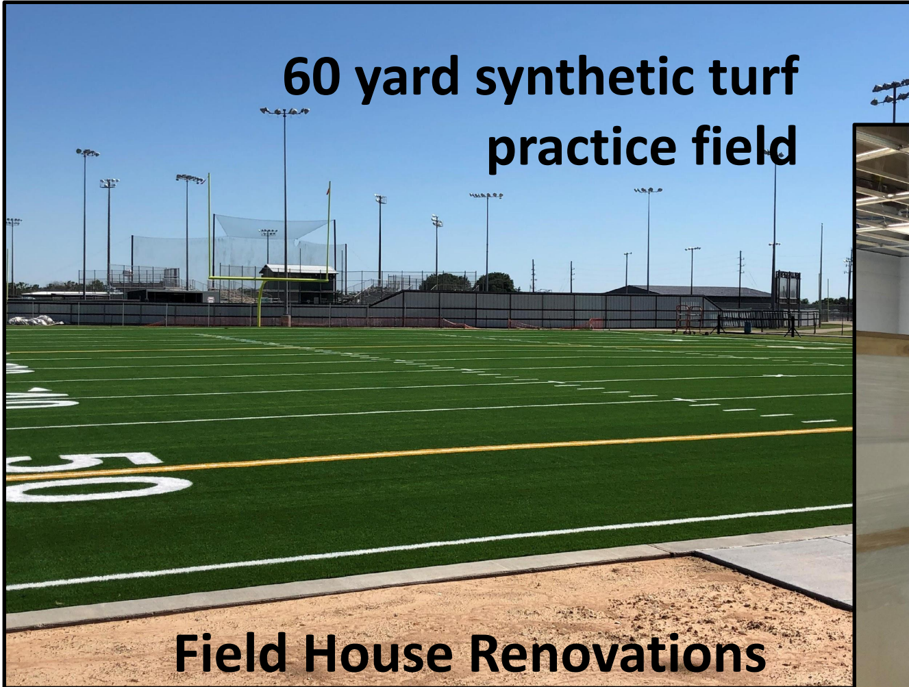
Field House Renovations