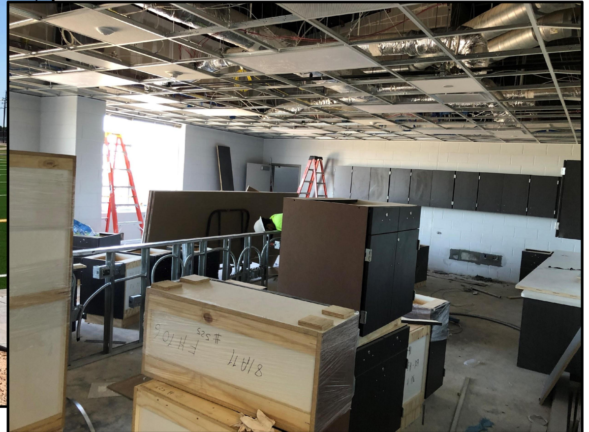
Coaches' office cabinets