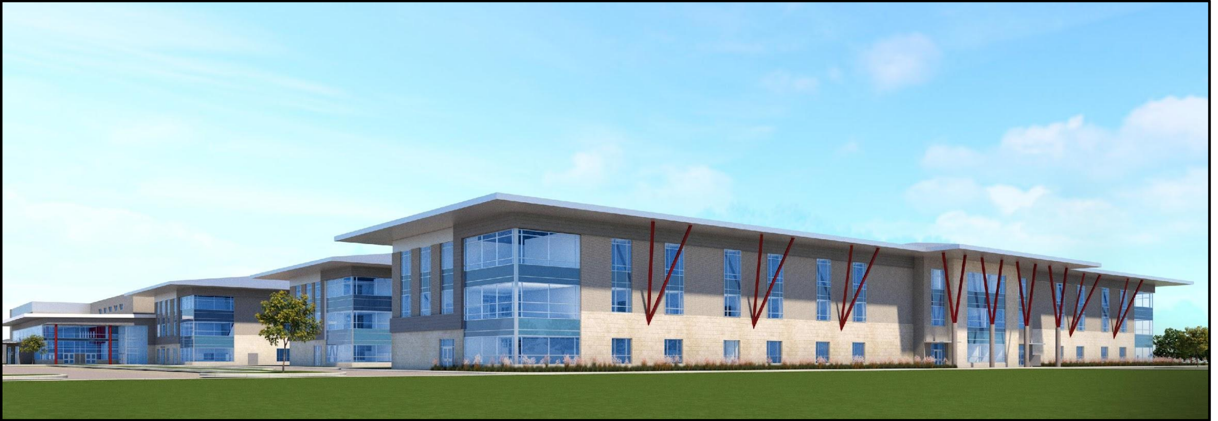
East Elevation from Student Parking