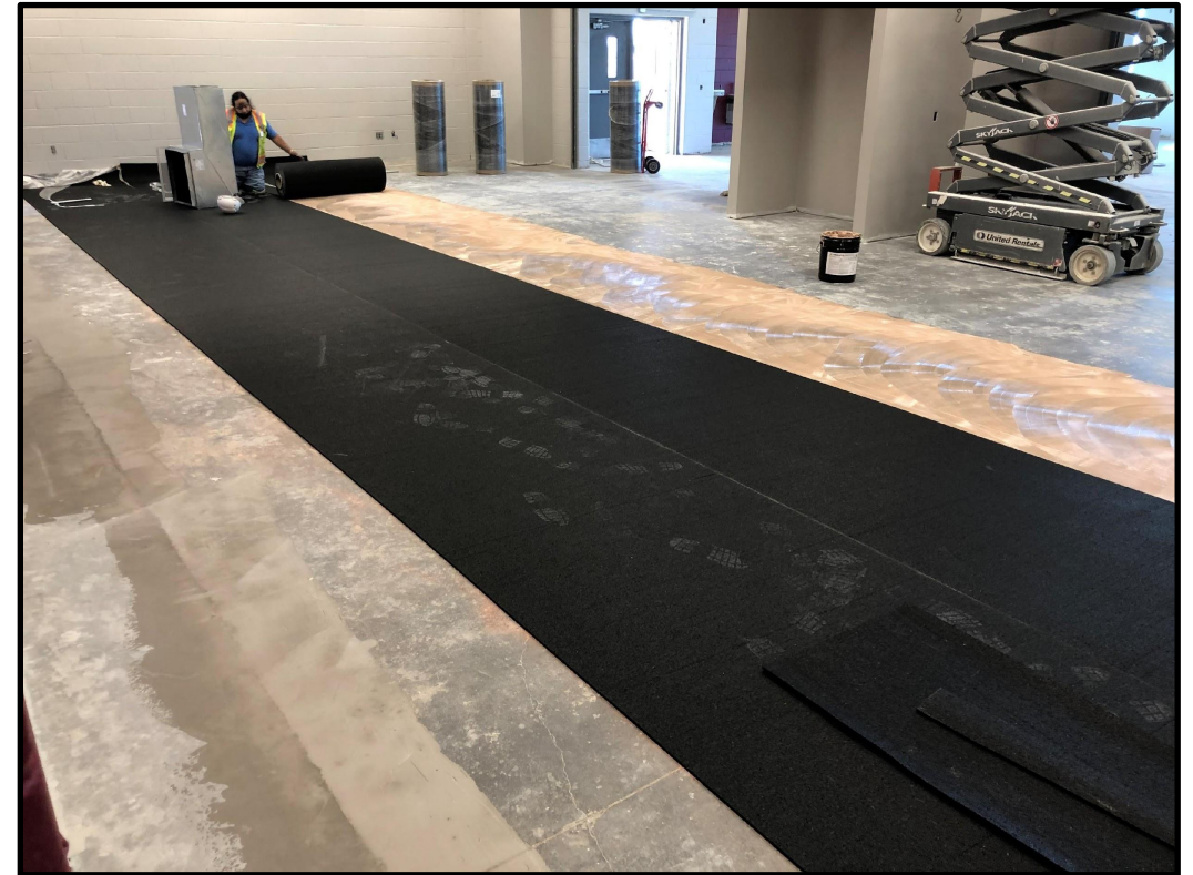
Rubber Flooring has started in Weight Room and Team Meeting Rooms