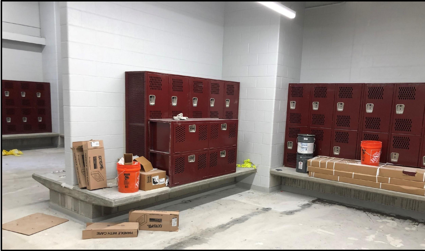
Field House Renovations